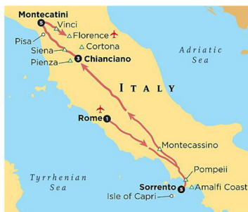
Map shows tour cities and the number of nights spent in each.

WHEN: March 10-25, 2018 (16 days/14 nights)